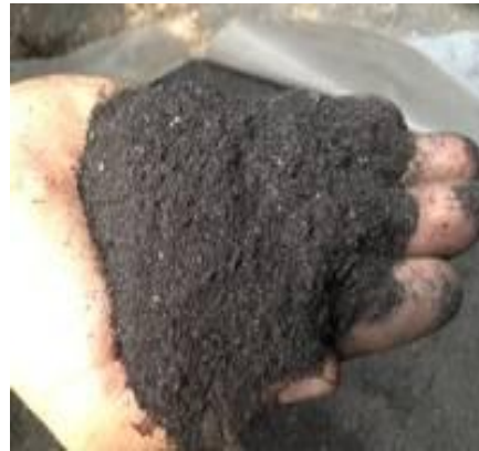
Figure 2. Rice husk ash