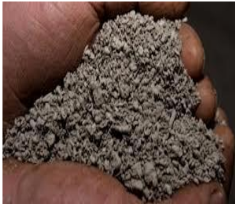
Figure1. Paper sludge

properties of natural soil and strength characteristics of stabilized soil were determined. A parametric study of the properties was conducted by varying the stabilizing agent and its percentage. Strength behavior of the soil is characterized in terms of unconfined compressive strength at varying percentage of stabilizing agents.